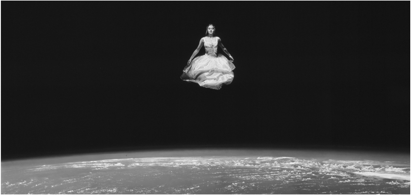
'Musterion' by Kees Bruin